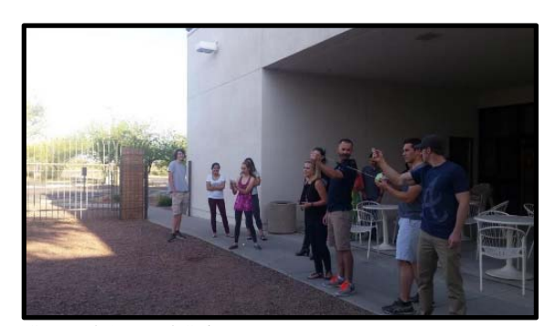
Second Annual Science Tournament