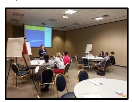
Members engaging in activities during the "Fostering Innovation" course.