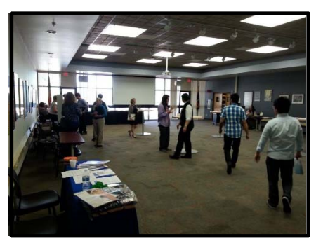
"Chemistry Career Fair" at Pima Community College East Campus on April 25<sup>th</sup>, 2015.