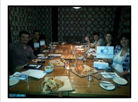
"How to Create a Safety Culture while Growing your Business" live webinar on April 28th at North Restaurant.

Moreover, on May 23<sup>rd</sup>, we received notice that we got a grant from national YCC to help with costs for another event of our choice. Also, we have been promoting the Younger Chemists Travel Grant to cover travel costs of up to $750 to an ACS meeting or workshop. You can apply and learn more about this grant at the local section website.