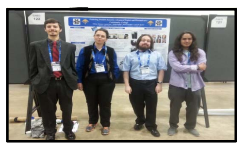
Denver Spring Meeting

Towards the end of the semester we were able to host our Second Annual Science Tournament that brought in roughly 20 students. This event served as a farewell to the Spring 2015 semester and allowed students to participate in a fun event.