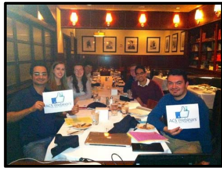
"Chemistry on the Silver Screen" live webinar on February 24<sup>th</sup> at Sullivan's Steakhouse.

The YCC group continued its activities during the second semester of 2015. We hosted a program-in-a-box webinar sponsored by national YCC and Proctor and Gamble. The live webinar "Tales of Lab Safety: How to Avoid Rookie Accidents" took place on October 30<sup>th</sup> at Sullivan's Steakhouse. Attendees learned more about safety in the laboratory and engaged in activities and discussions about lab safety while enjoying free appetizers provided by YCC.